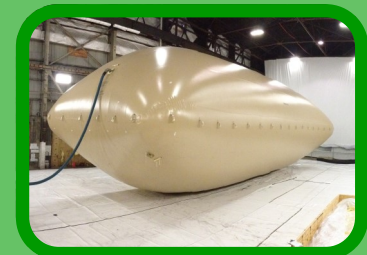
Fuel / Chemical Storage