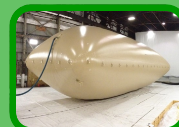
Fuel / Chemical Storage