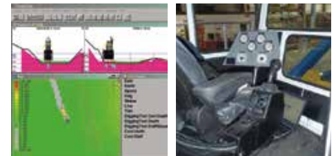
GPS is a standard feature

The DM-60 comes with two power units. The 375HP (280 kW) John Deere engine powers the dredge pump and cutter while the 275 HP (205 kW) power unit for self-propulsion and auxiliary functions. Fuel consumption is 20-26 gallons per hour (75-98) depending on whether the self-propulsion system is in use or the cable drive system is in use. The power units are Tier III and come standard with security locks and easy open panels to access any part of the engine or hydraulics. The hydraulic fluid is chosen based on climate, but optional biodegradable oil is available on highly sensitive environmental projects.