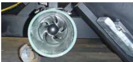
Bow thruster for side current correction & quick turns.

which can run off of two, three, or four point anchor system. The cable drive system can be rigged in several configurations using a combination of the following anchor point types: land based anchor plates, trees, pilings, or any other heavy weight grounded object.