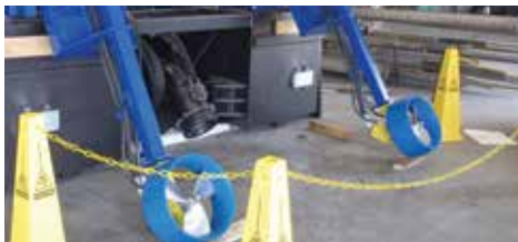
Dual prop drive self-propulsion system